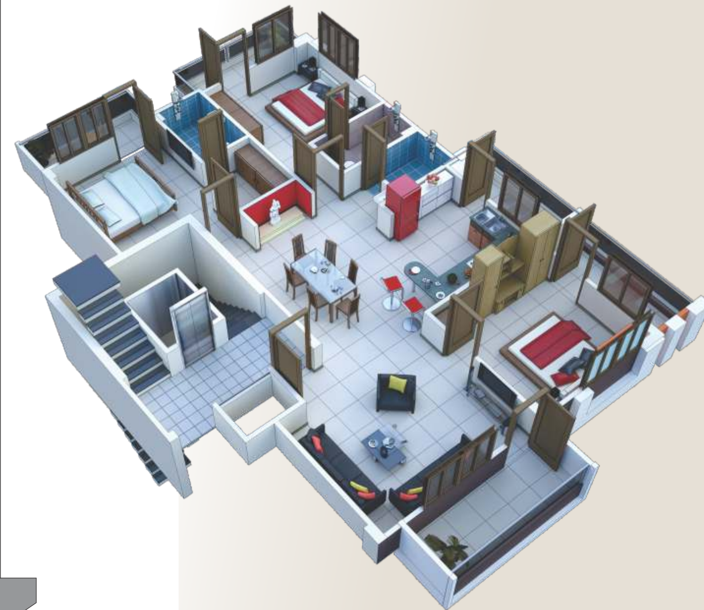
Typical Floor Layout :