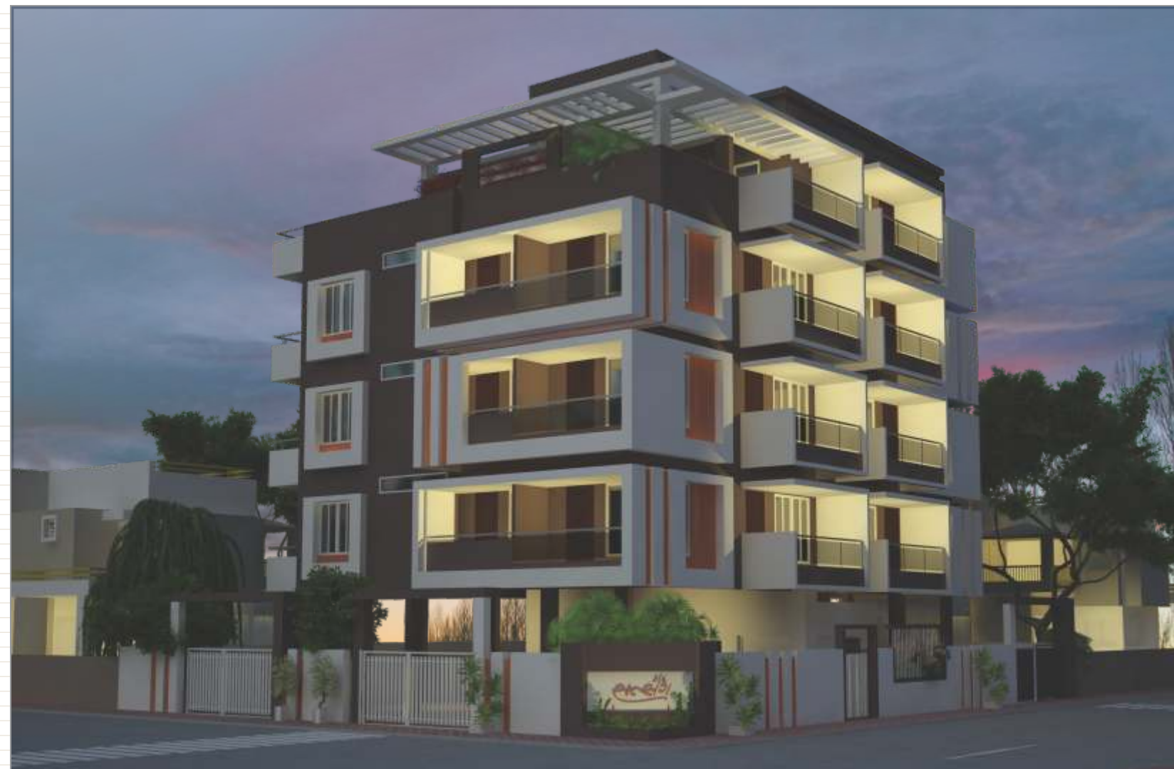
Site : SATSANG, Nr. Maiya Sharda Hospital, Mahadev Area, Vallabh Vidyanagar - 388 120. (Anand)