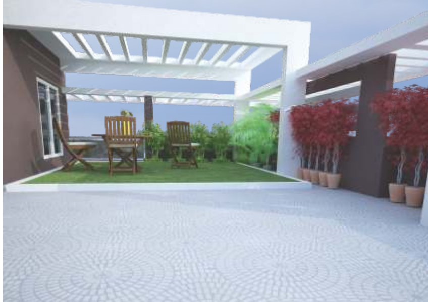
Pent House Plan :